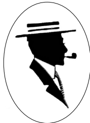
Oval Perfume Locket - LKB13